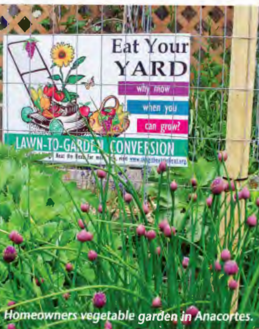
Homeowners vegetable garden in Anacortes.

Plants native to the Northwest or adapted to our climate will require less maintenance and often less supplemental water, provided they are planted appropriately.