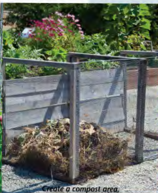
Create a compost area.