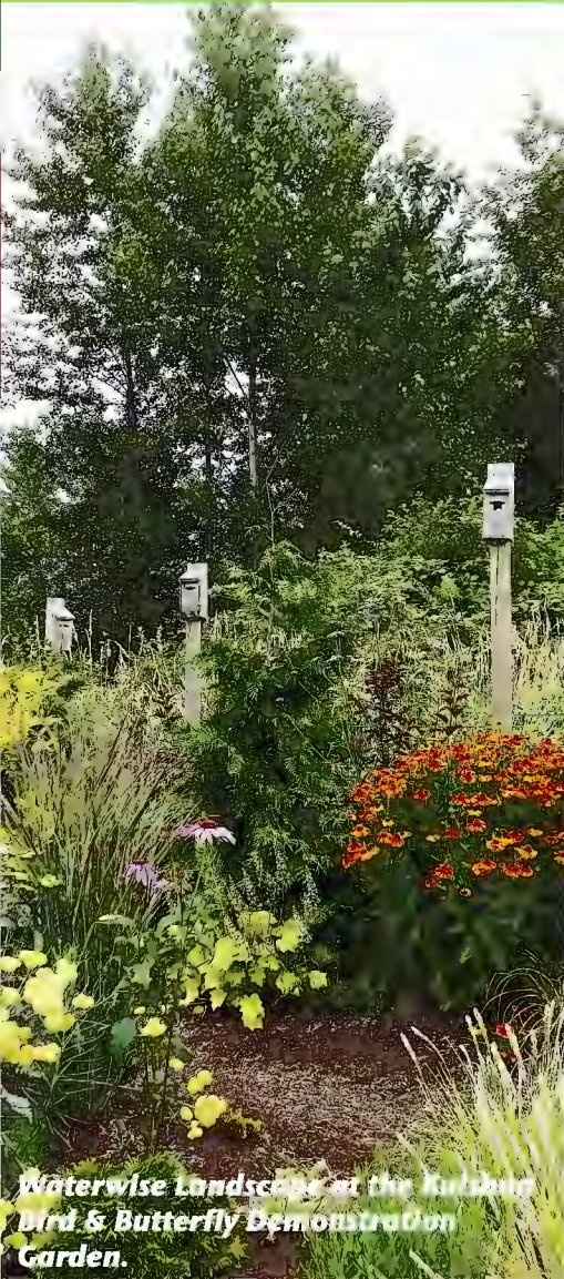
Waterwise Landscape at the Harbour Bird & Butterfly Demonstration Garden.

Taking time to strategize and plan your landscape will save time, frustration, and maintenance down the road and allow you to develop an overall design that is better suited to the features of your site.