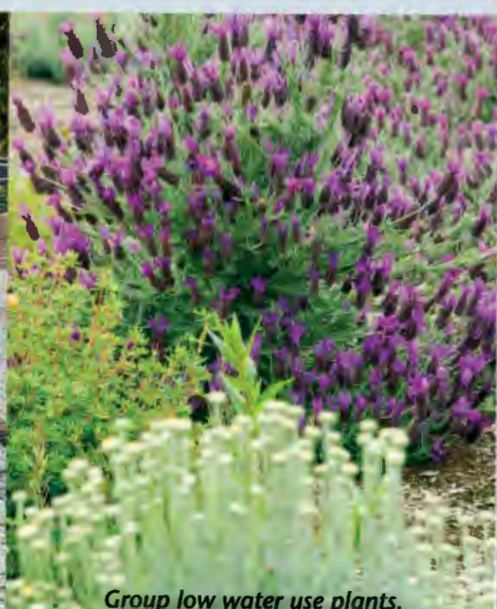
Group low water use plants.